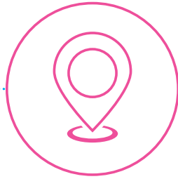
SHARE WITH CONFIDENCE